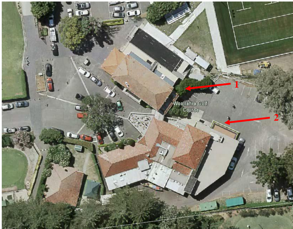
Figure 4: Aerial photograph over the site. Key: (1) George S. Grimley Pavilion; (2) Woollahra Golf Clubhouse (Woollahra Council GIS).