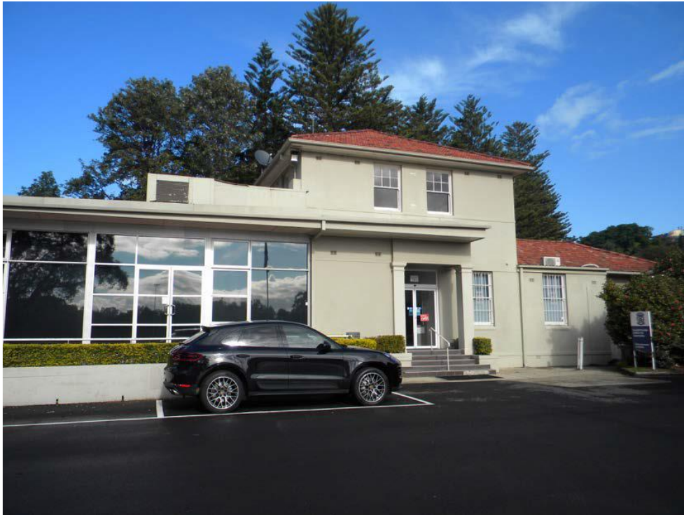
Figure 2: Woollahra Golf Clubhouse, north-eastern elevation (WP Heritage and Planning)