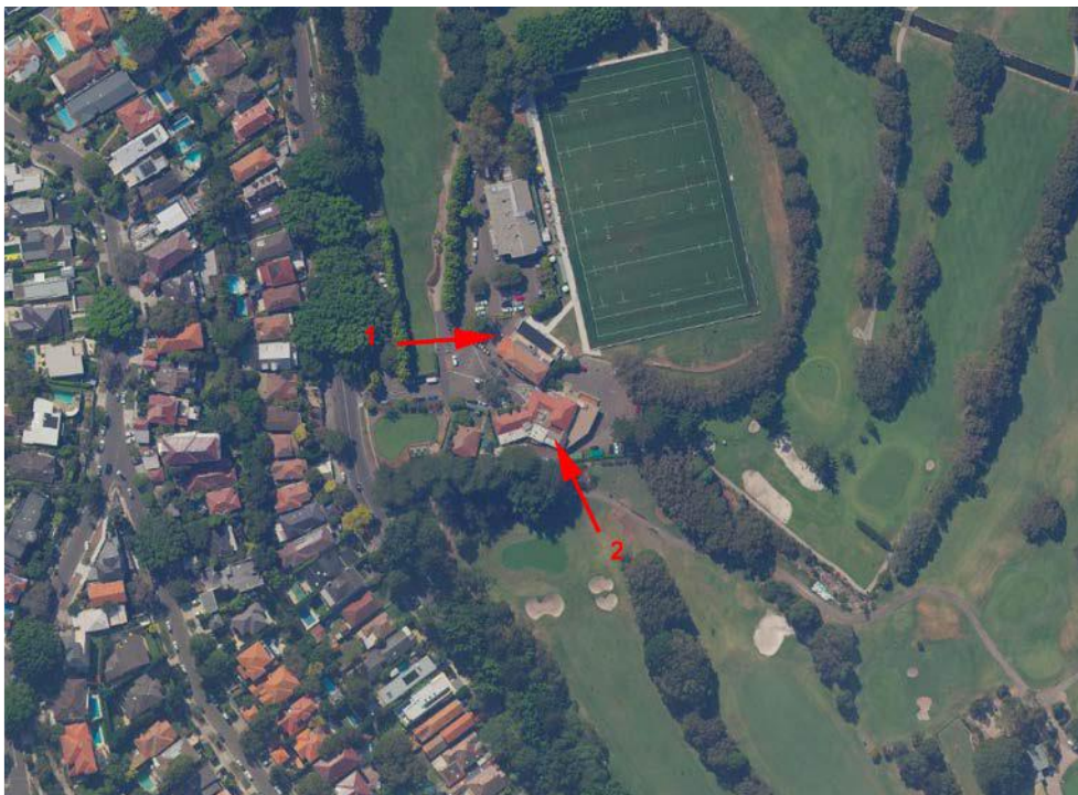
Figure 3: Location of buildings within Woollahra Park (SIX Maps; annotation in red by WP Heritage and Planning) Key: (1) George S. Grimley Pavilion; (2) Woollahra Golf Clubhouse.